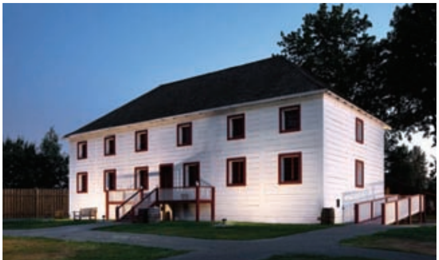
The white timber buildings are accented with shielded, stanchion-mounted 15-W LED floodlights.