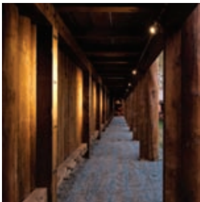
The gallery is lighted with angle-mounted downlights tucked behind a shielding beam.

floodlights, focused for uniformity and minimum spill light. The other five timber buildings are lighted with 7-W downlights mounted under the overhangs of each column. The lighting illuminates walkways, defines boundaries and emphasizes the architecture. The soft floodlighting of the white buildings creates planar elements in contrast to the sharp rhythmic pattern on the timber buildings. “The scene really has a natural look,” says Zbrizher.