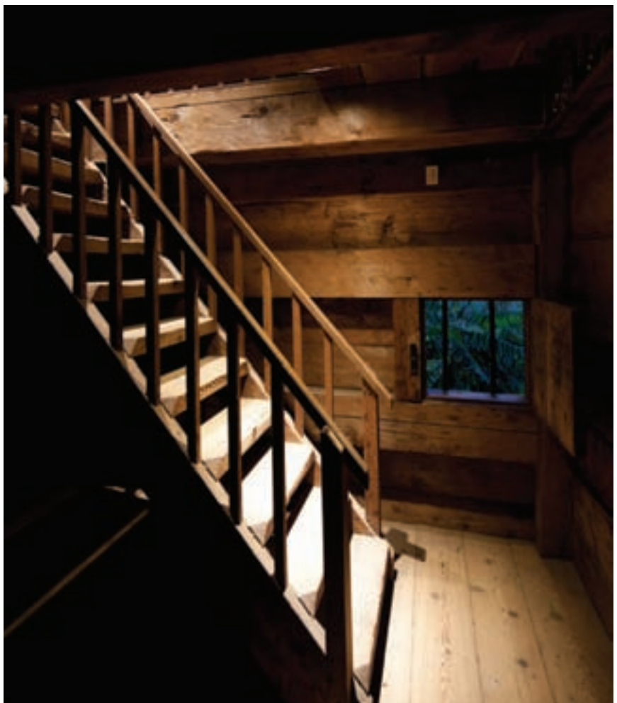
The stairs leading to the top of the bastions use two 7-W LED downlights to create a soft glow.